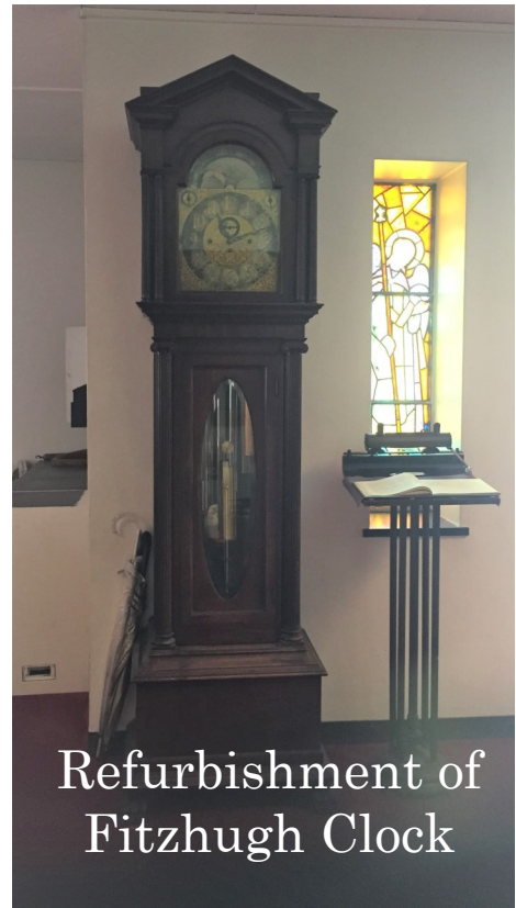
Refurbishment of Fitzhugh Clock