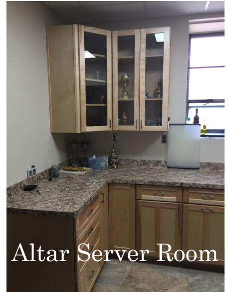
Altar Server Room