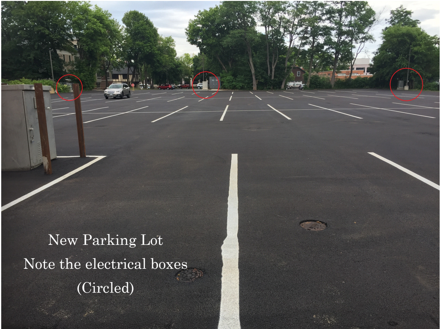
New Parking Lot Note the electrical boxes (Circled)