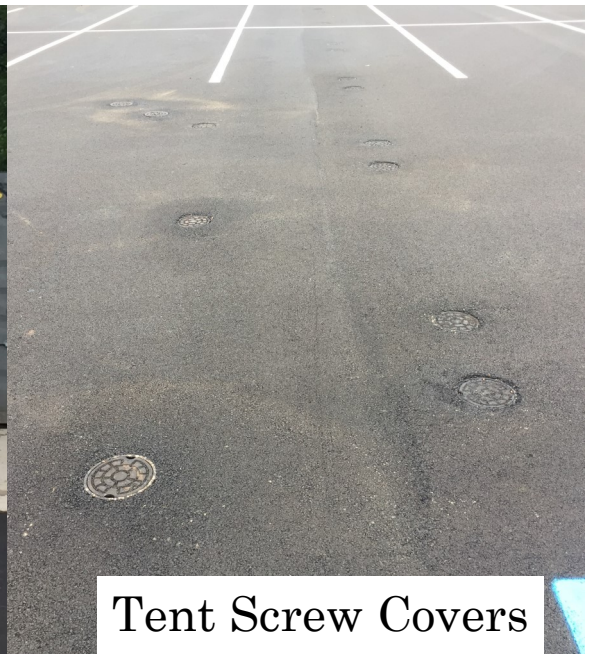
Tent Screw Covers