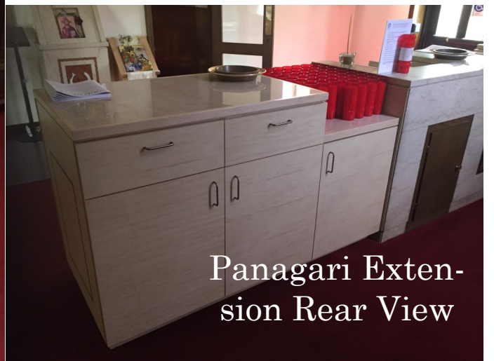
Panagari Extension Rear View