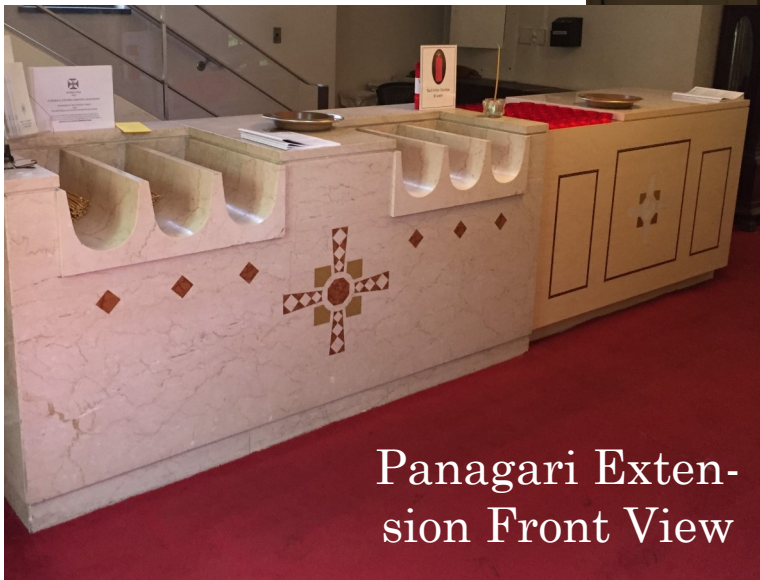
Panagari Extension Front View