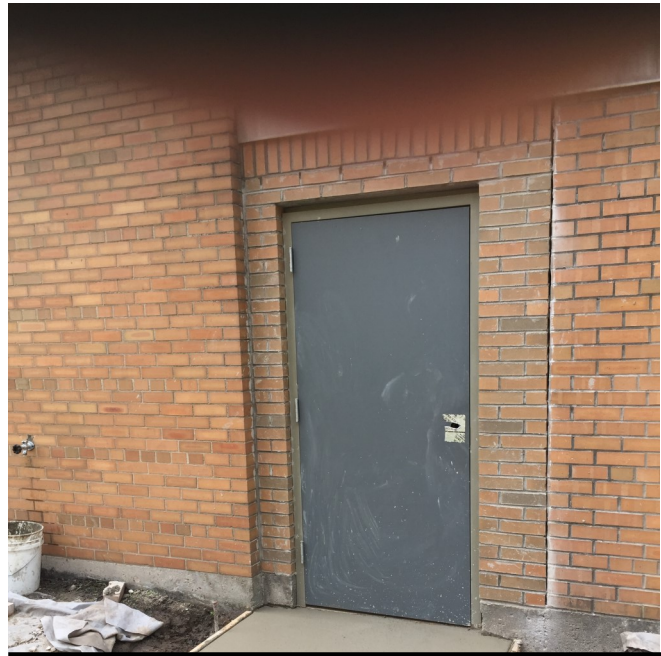
New Side Door and Concrete Pad for Improved Security/Safety