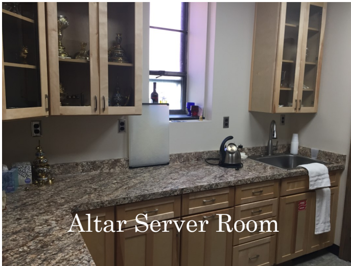
Altar Server Room