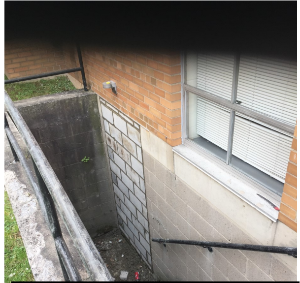
Sealing of Boiler Room Door for Improved Security