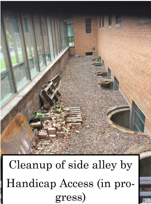
Cleanup of side alley by Handicap Access (in progress)