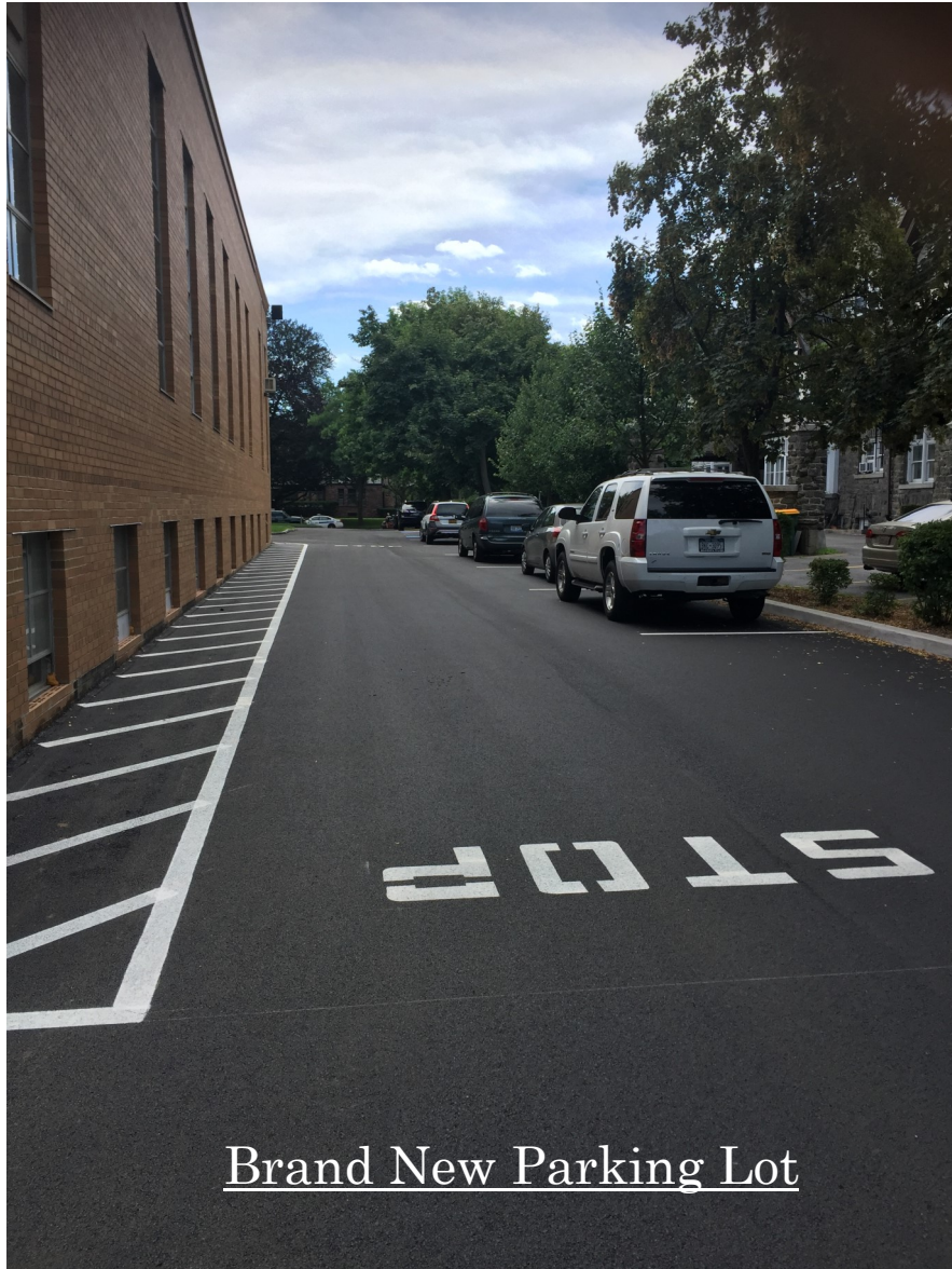
Brand New Parking Lot