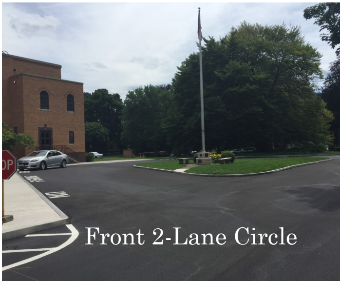
Front 2-Lane Circle