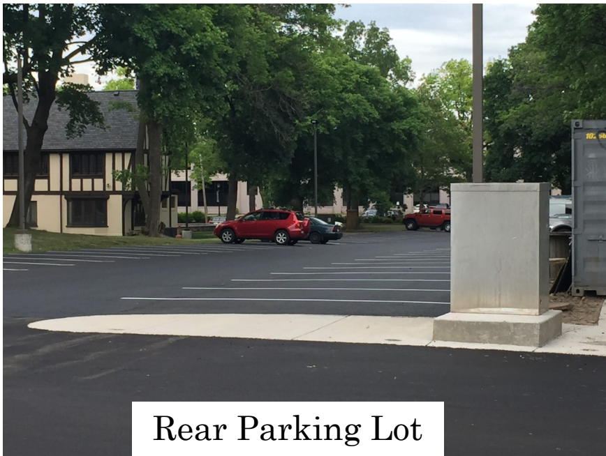
Rear Parking Lot